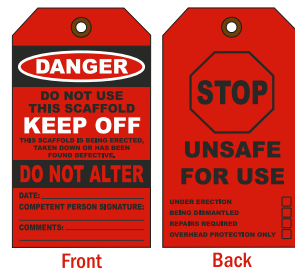
Scaffold Tags 3-1/4" x 5-5/8"