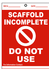
Scaffold Tags 4" x 5-1/2"