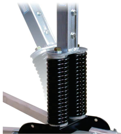
X4702-SRG Dual heavy duty springs for wind relief

— CRASH TESTED TO — MASH SELECTED MODELS