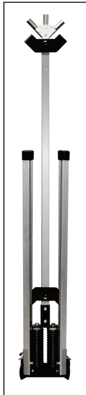
X4702-RGB Stored Position

— CRASH TESTED TO — MASH SELECTED MODELS