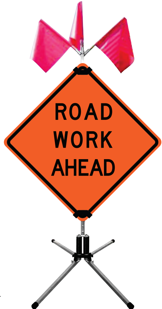
X4702-RGB with 48" x 48" rigid sign