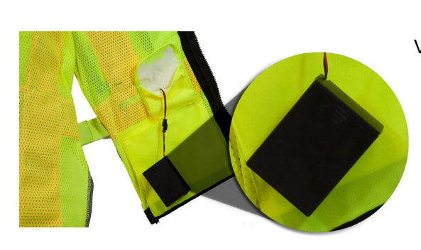
Inner Pocket for Battery Pack Vest is NOT sold with Batteries, 3 AA batteries are required.