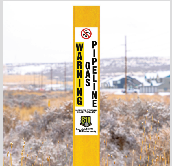
YELLOW DRIVABLE MARKER WITH DECAL