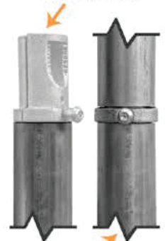
Illustration of Top & Anchor Posts