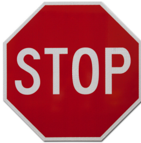
HIP High Intensity Prismatic