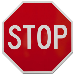
EG Engineering Grade